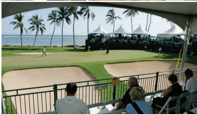
View from Ocean Club Skybox at 17th Green